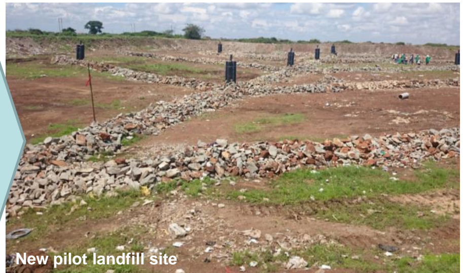
New pilot landfill site